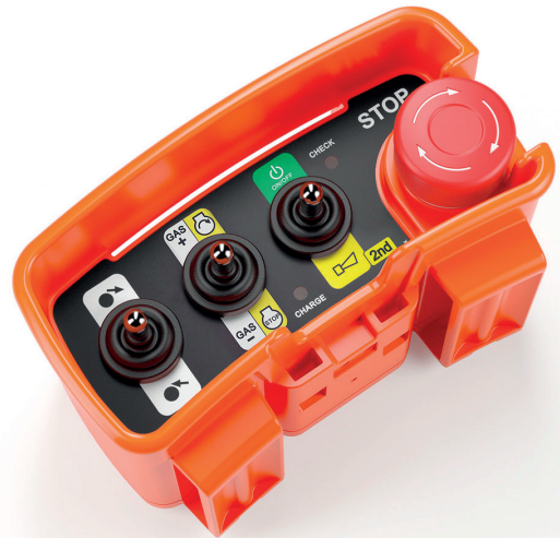
Radio remote control for single winch

Radio remote control 4 functions ELCA, for single winch