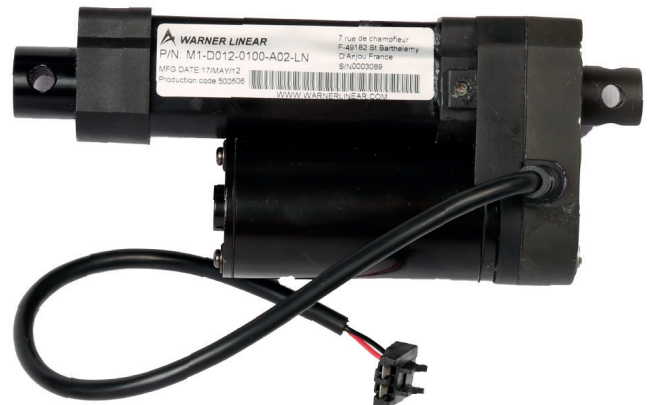
Accelerator cylinder (Warner) 12 V ( VER00024 )